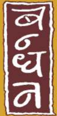
The Alumnae Association

Association also does a lot of other things to promote connectivity and interaction of the alumnae with the present students of the university. Some of these are -